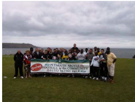
The teams who took part in the mini World Cup inclusion football Tournament