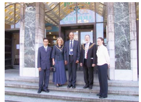
The Lord Mayor and Lady Mayoress of Plymouth officially launch the Plymouth BME Forum (Unity Plymouth) 29th June 2006

Plymouth is the largest city south of Bristol, and over the past few years has seen a large growing Black and Minority Ethnic population, mainly due to the dispersal of asylum seekers and refugees to the city. Part of Fata He's role as the sub regional BME infrastructure lead was to establish an independent representative BME Forum within the city of Plymouth in which BME people from many diverse communities are given the opportunity to 'speak for themselves' instead of agencies speaking for them.