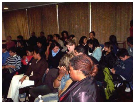
Meeting of members of Unity Cornwall