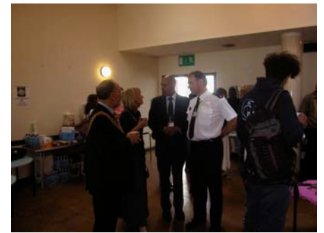
Lord Mayor meets with people at Unity Plymouth launch