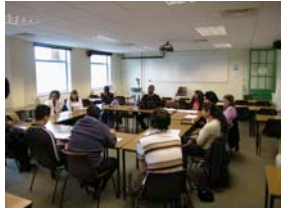
Meeting of the Plymouth B&ME Forum

BME communities in Plymouth will use the forum as a platform to have direct links to statutory organisations and agencies directly or indirectly involved with issues that affect their lives and wellbeing.