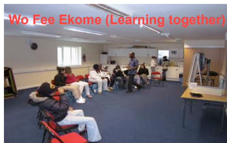
Together) Saturday Learning Project. A joint partnership with Granby Island Community Centre and the Barbican Theatre. This project was funded by the Community Fund (Big Lottery).

The Fata He Saturday learning project was officially launched on 28th January 2006. The project is built on the philosophy that “It