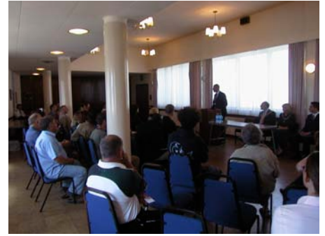
Attendees at the launch of Unity Plymouth