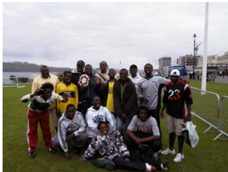
Winners of the Fata He 'Inclusion' challenge shield - the 'Dynamic Stars'

On Saturday 20th May 2006 - Lord Mayors Day, Fata He sponsored and supported the first citywide mini-world cup soccer event on the Plymouth Hoe. Two African teams, the Plymouth Argyle disability teams and two teams from Working Links entered the tournament. The Fata He 'Inclusion' Challenge Shield was eventually won by 'Dynamic Stars' African football team who